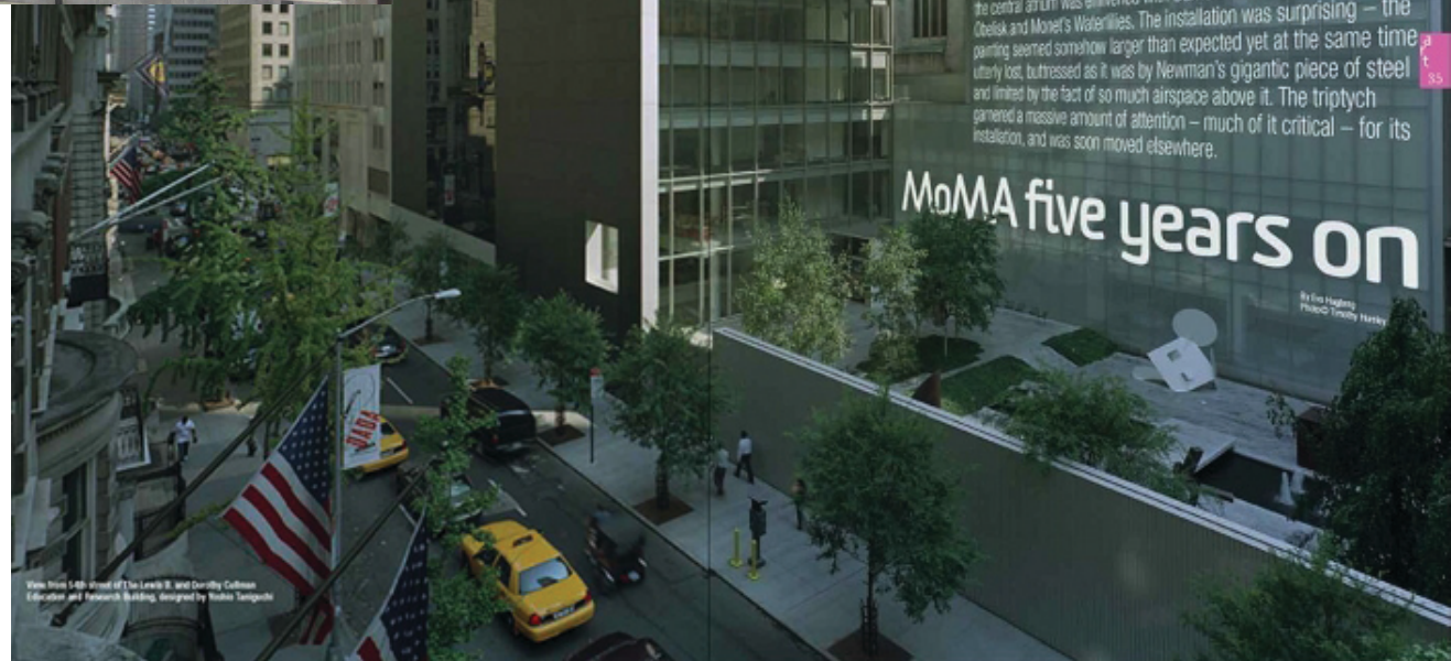
Museum of Modern Art