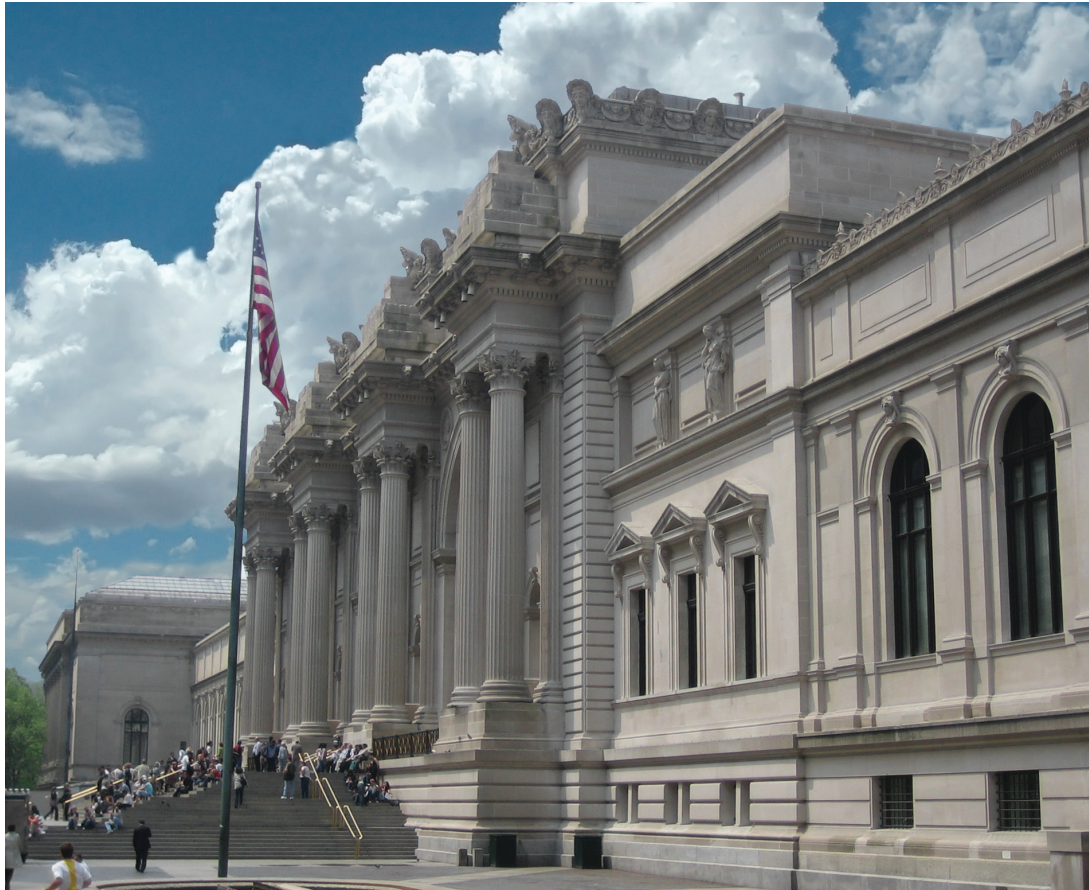
Metropolitan Museum of Art