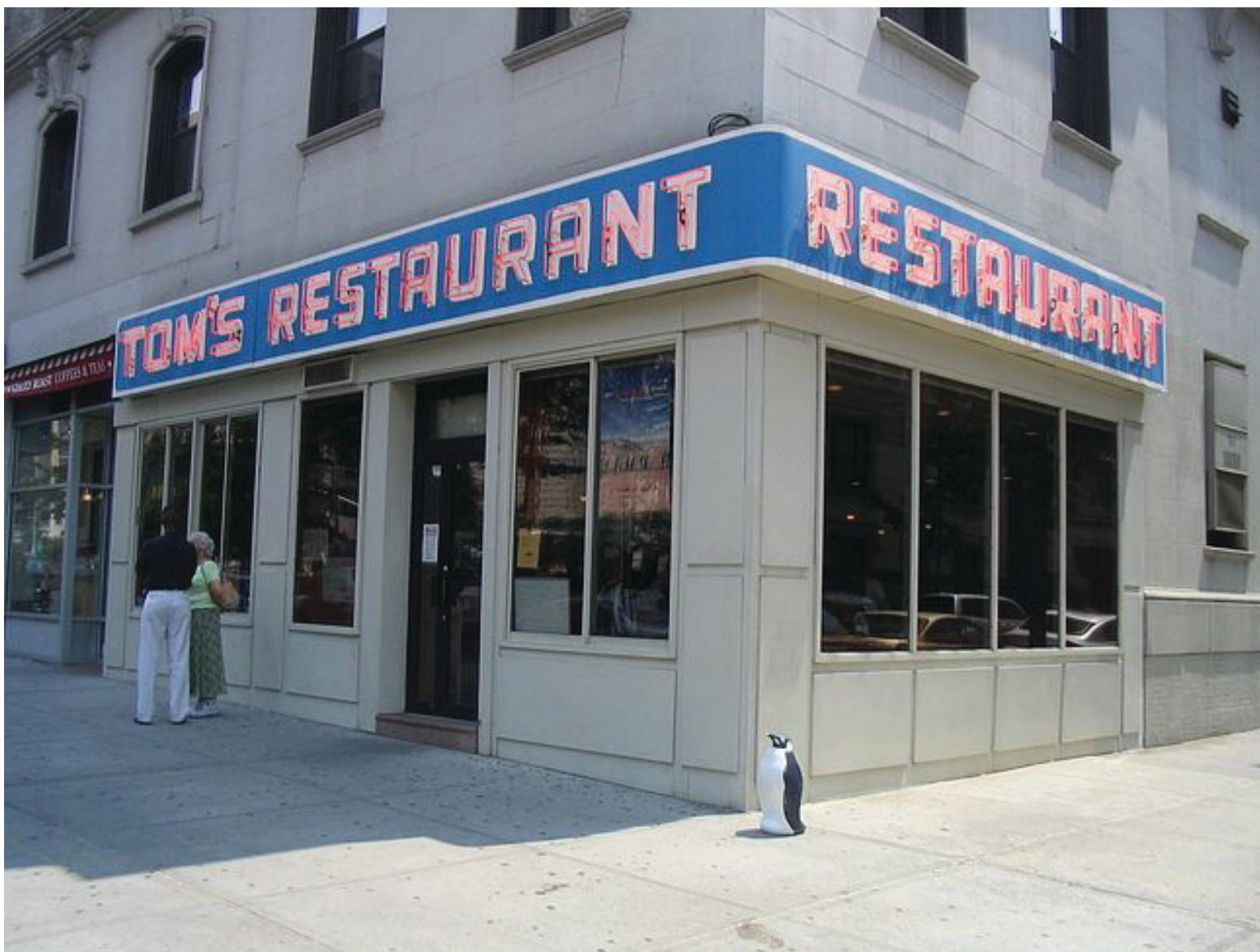
The neighborhood restaurant used in the TV show "Seinfeld"