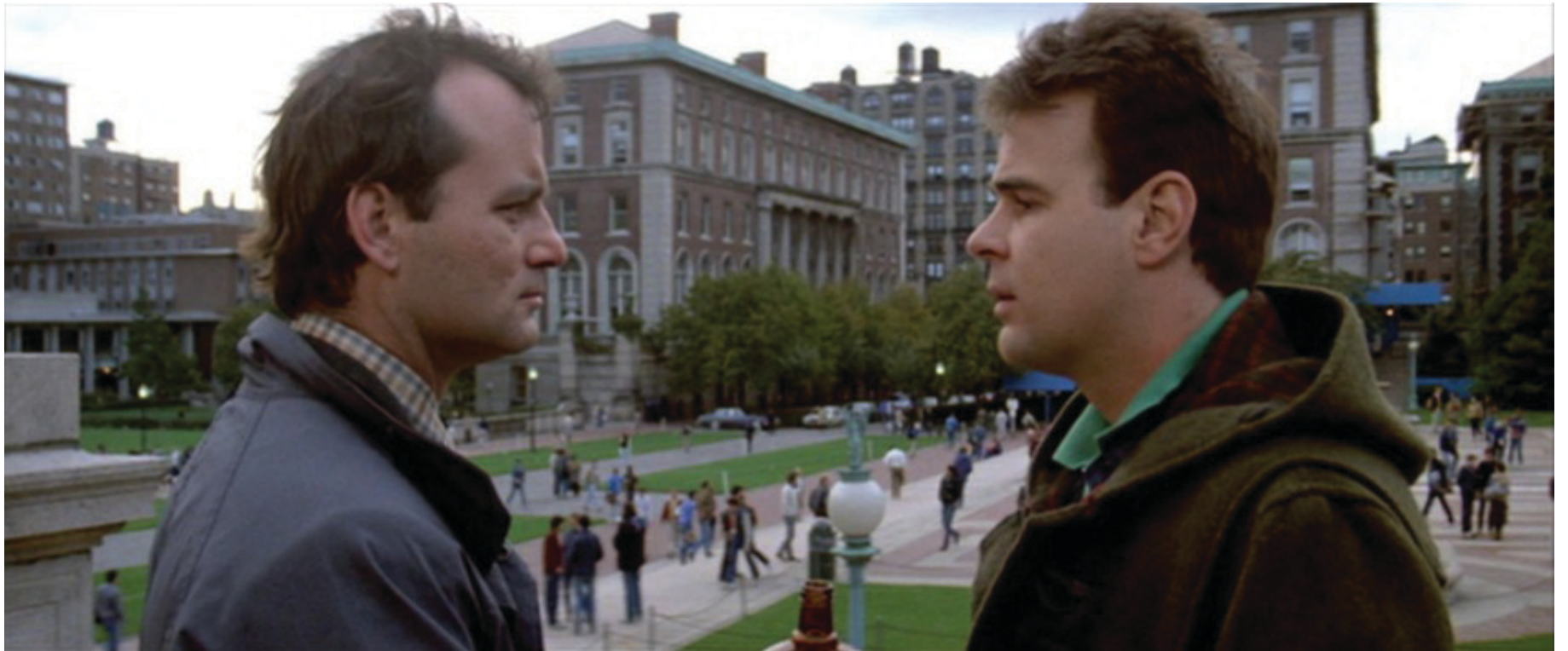
Bill Murray and Dan Akroyd in "Ghostbusters"